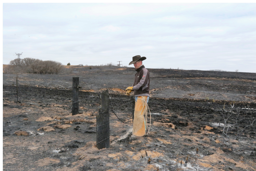
A farmer inspects fences that burned on the 600 acres of land where he runs cattle in Wheeler County, Texas.

In total, the Miller Gustin team made an impact of over $19,000 toward wildfire relief efforts.